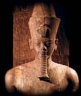
AMENHOTEP III 1390 – 1353 B.C.

Akhenaten's parents had a wealthy and politically stable reign. Their first son died; their second took the throne.