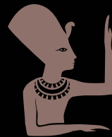
NEFERNEFRUATEN (SMENKHKARE?) 1335 – 1332 B.C.

In his 17 years as pharaoh, the heretic Akhenaten (born Amenhotep) changed his name, abandoned Egypt's capital to build his own, and completely revamped art and religion. The unprecedentedly powerful Nefertiti was his principal wife, and Kiya his Greatly Beloved.