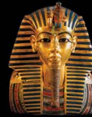
TUTANKHAMUN 1332 – 1322 B.C.

Enthroned when he was about ten, Tut may have been a son of Akhenaten and Kiya. He rejected Akhenaten's revolution, likely influenced by ambitious advisers, and died young with a suspicious head wound.