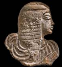
HOREMHEB 1319 – 1292 B.C.

This mighty general strengthened the empire after Akhenaten's break from conquest. Later he is inserted into the records as Amenhotep III's successor, erasing the Amarna interlude and its controversial cast of characters from official history.